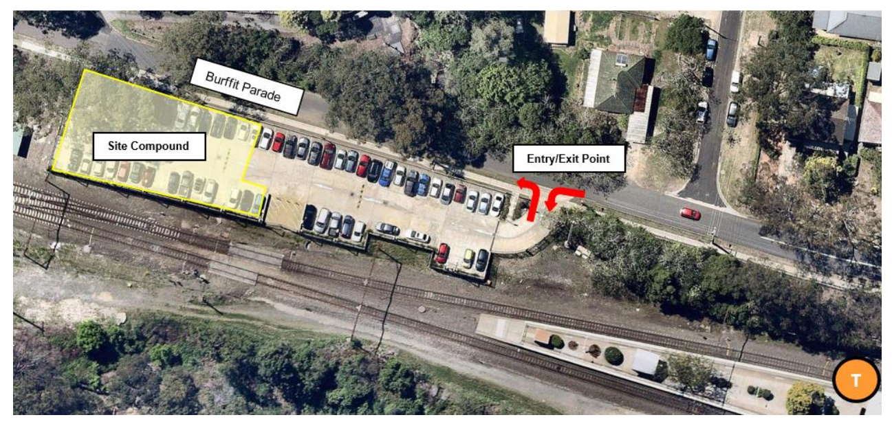
Location of spaces to be closed within the western commuter car park on Burfitt Parade for establishment of a site compound.

The remaining spaces in this car park will continue to be available for commuters through the eastern entry off Burfitt Parade, which will function as both an entry and exit point during works. Signage will be in place to assist customers with these access changes.