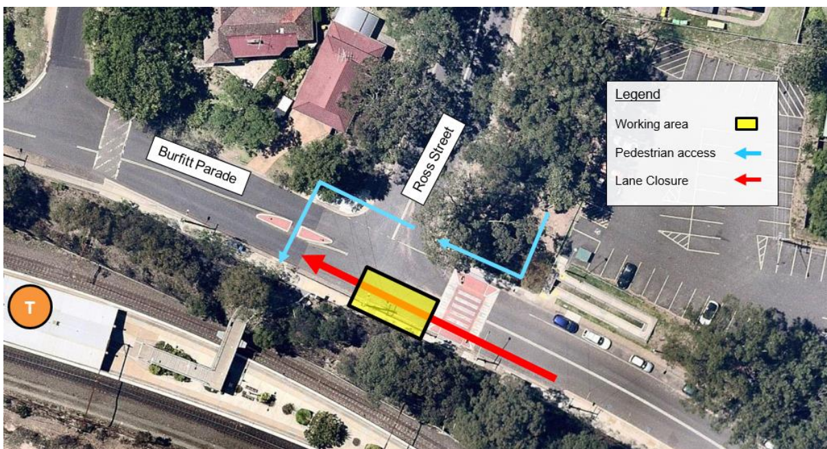
Location of work area on Burfitt Parade

A piling rig will be temporarily located on the westbound lane of Burfitt Parade beside the pedestrian crossing, for a period of four days between Monday 18 February to Thursday 28 February 2019 . During this time, pedestrian access to the station will be diverted and Burfitt Parade westbound lane will be closed. Traffic management and signs will be in place to assist motorists and pedestrians with the changed conditions.