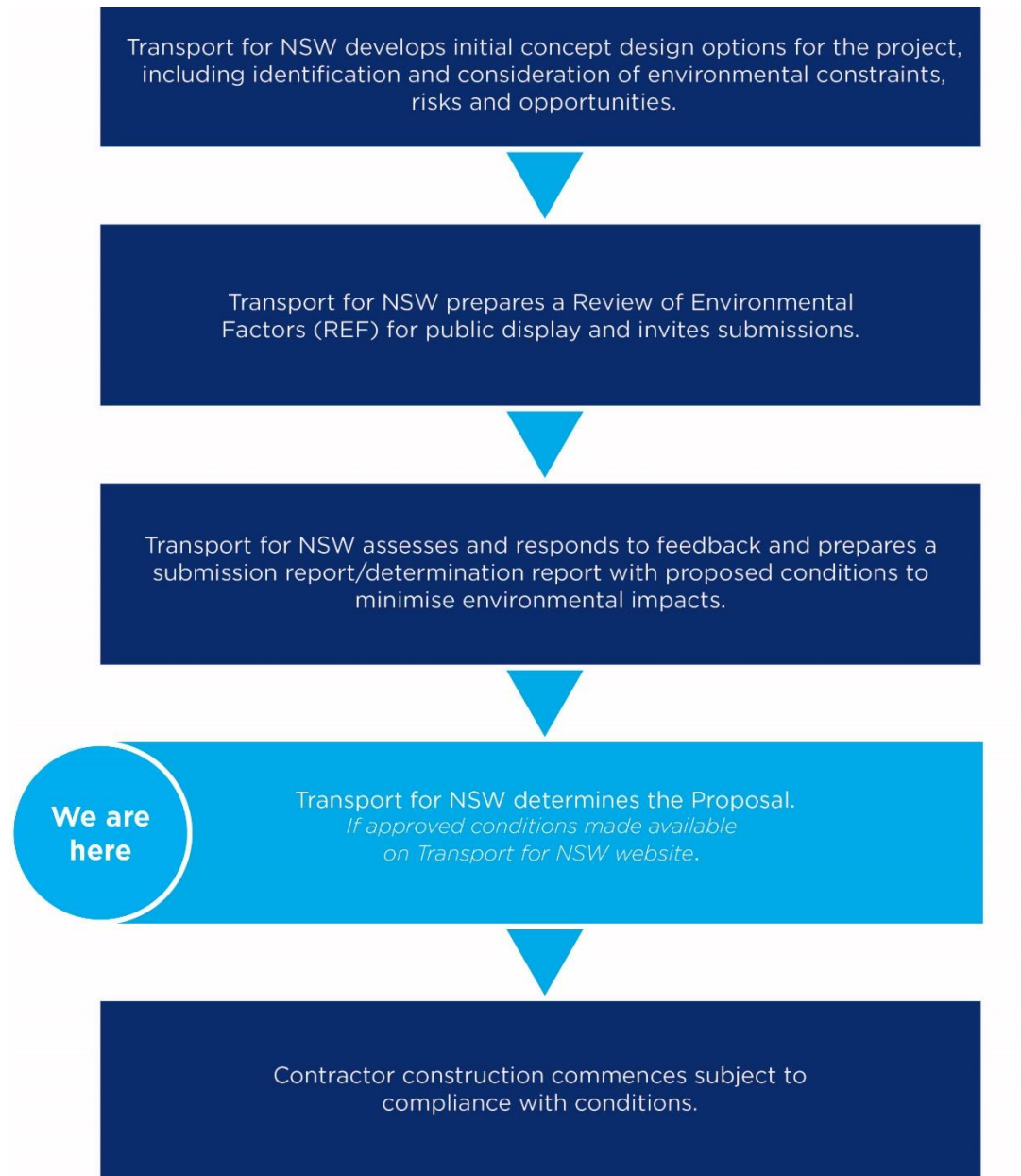
Figure 1: Planning approval process

Prior to proceeding with the Proposed Activity, the Secretary for TfNSW must make a determination in accordance with Division 5.1 of the EP&A Act (refer Figure 1).