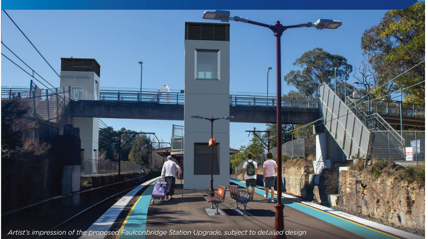
Artist's impression of the proposed Faulconbridge Station Upgrade, subject to detailed design