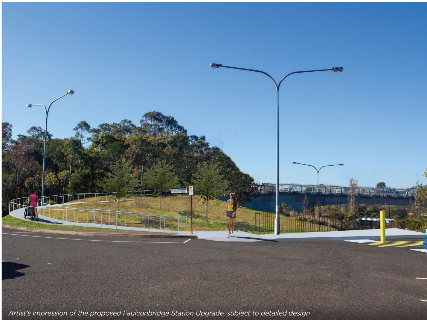
Artist's impression of the proposed Faulconbridge Station Upgrade, subject to detailed design

The Review of Environmental Factors is a planning document outlining the proposed work, potential impacts and mitigation measures. The document includes comprehensive assessments on the existing environment and expected impacts of the project including traffic and transport, biodiversity, visual impact, noise and vibration, heritage, and how they will be managed.