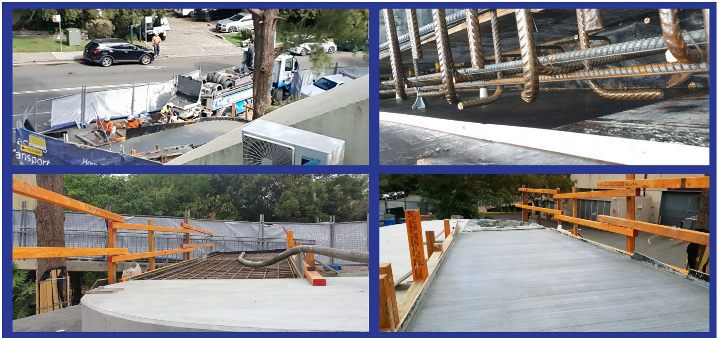
Image: Construction updates of new ramp