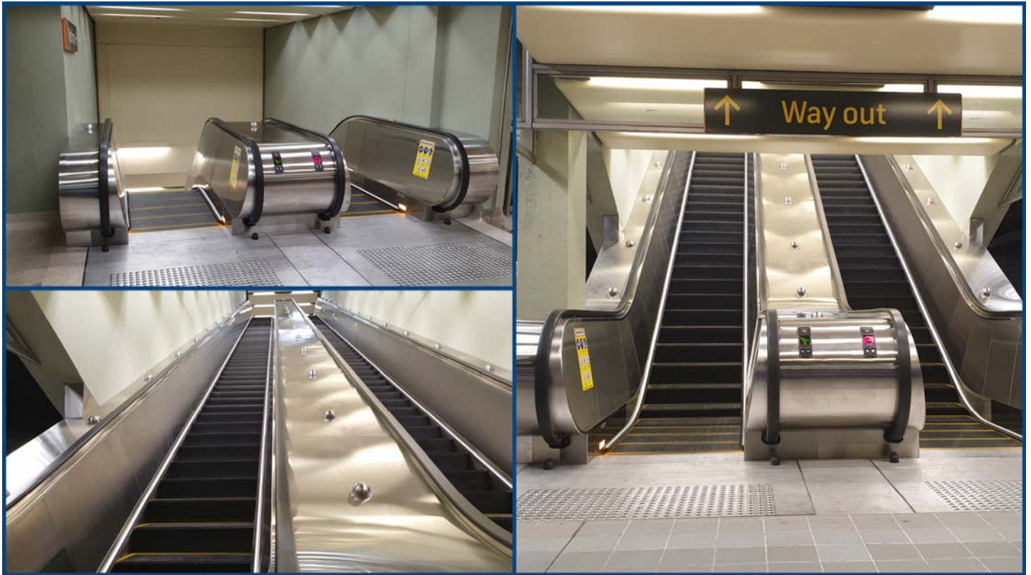
New escalators from the station platforms to the concourse

The Transport Access Program is a Transport for NSW initiative to provide a better experience for public transport customers by delivering accessible, modern, secure and integrated transport infrastructure. Last month we continued to make progress with the project, with the opening of the new escalators.