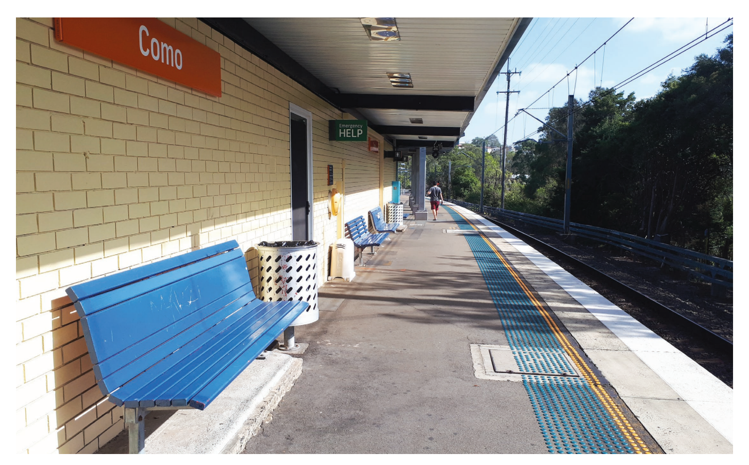
Como Station, March 2018.