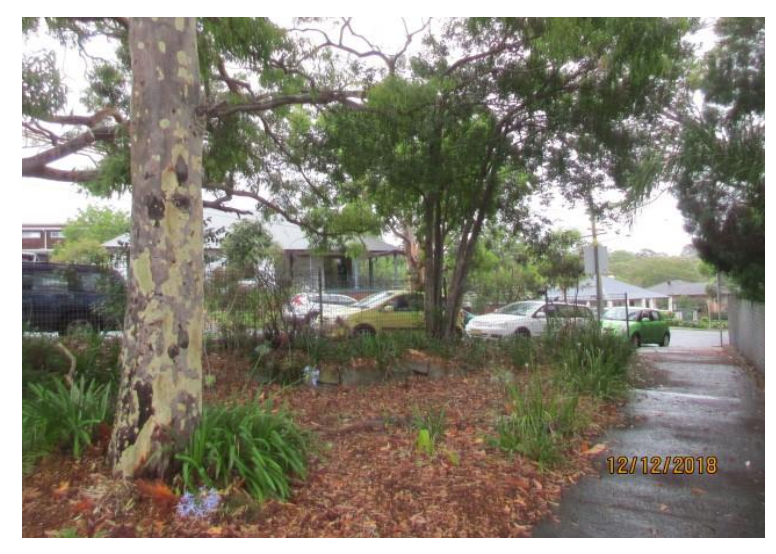
Photo 8 Tree 14 (Spotted Gum), Tree 15 (Smooth-barked Apple) and Tree 16 (dead tree) to be removed for the car park extension and creation of additional disabled parking.