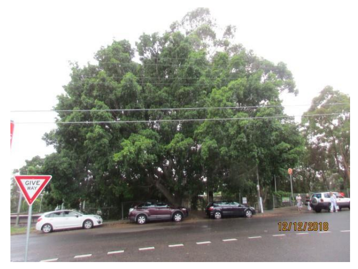
Photo 5 View of the Hill's Weeping Fig (a component of tree group 4), viewed from the western side of Como Parade.

in New South Wales and northwards, especially as a roadside tree especially near the coast" (Spencer, 1997). This specimen has a low, broadly-spreading canopy which may require management to allow vehicular access. A branch which extended over the road has recently been damaged, probably by a passing vehicle (Photo 6).