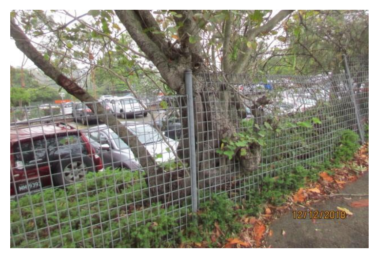
Photo 10 Over-mature *Bauhinia variegata, growing to the south of Tree 12

Tree removal and excavation for construction of the lift and access ramp would also require the removal of small trees, shrubs and forbs. Approximate numbers include: