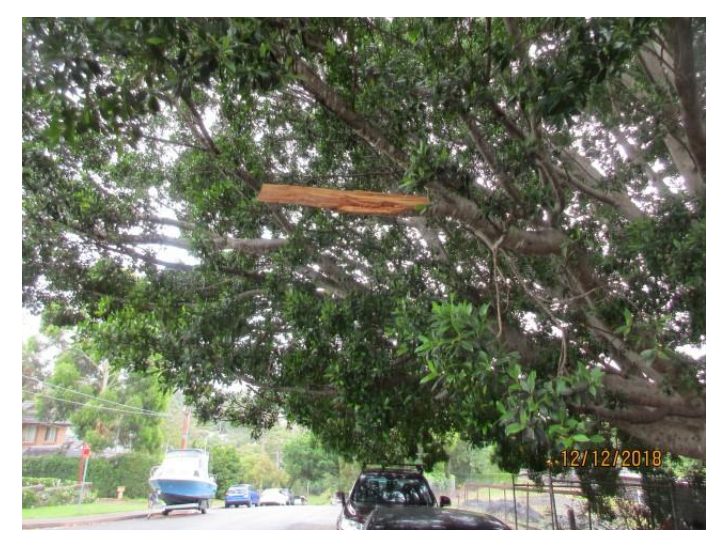
Photo 6 Recently broken lateral (branch) of the Hill's Weeping Fig (a component of Tree group 4), above south-bound parking lanes on Como Parade.

Photo 5 View of the Hill's Weeping Fig (a component of tree group 4), viewed from the western side of Como Parade.