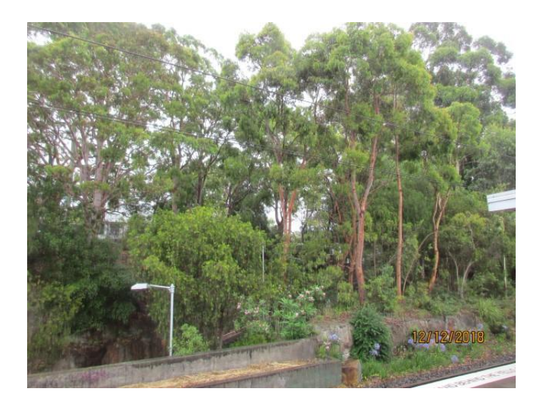
Photo 1 Patch of Coastal Enriched Sandstone Dry Forest on western side of railway line, viewed from station platform. This patch occurs adjacent to the Proposal site in the north.

Regional-scale mapping of vegetation (OEH, 2013) of the Proposal site indicates the occurrence of patches of "Urban: Weeds and Exotics" on both sides of Como Station. North of the station, the patches of vegetation on both sides of the railway track are described as "Coastal Enriched Sandstone Dry Forest". The occurrence of numbers of Smooth-barked Apple ( Angophora costata ) within the western side of the Proposal site indicate a gradient between planted non-indigenous species and self-recruitment of components of Coastal Enriched Sandstone Dry Forest, the vegetation type which likely originally occurred on the site (Photo 1).