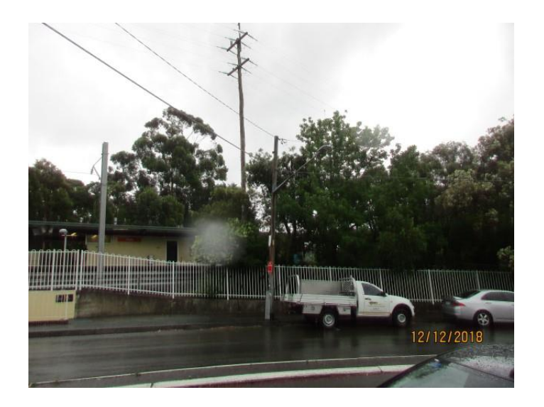
Photo 2 View of patch of planted trees and shrubs on eastern side of station.

A dense groundcover of mostly exotic grasses and forbs extends along this fenced section of Railway Reserve.