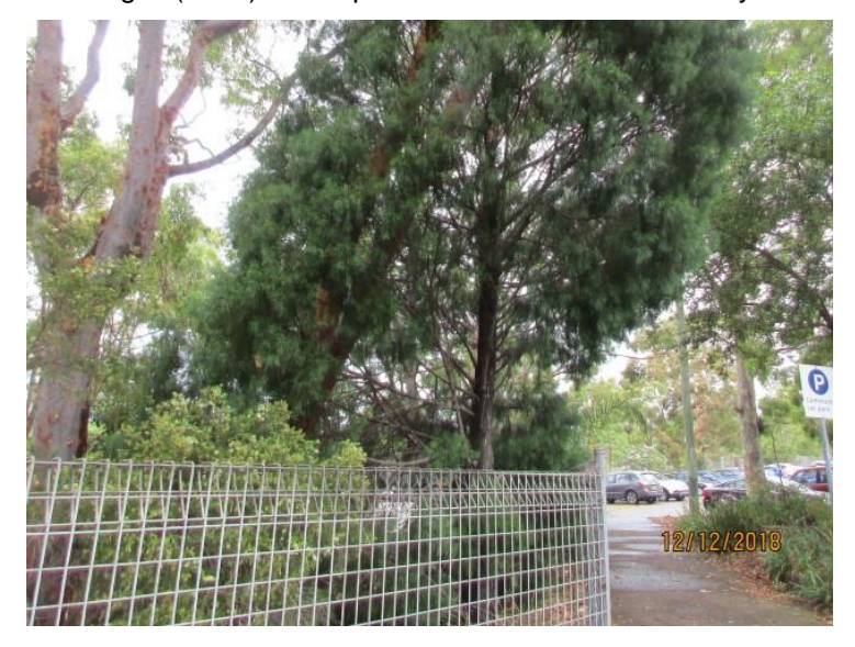
Photo 4 The regionally uncommon Port Jackson Cypress (Tree 5), growing near the pedestrian access entrance to Como Parade carpark.

One specimen of regional importance is Tree 5, a Port Jackson Cypress ( Callitris rhomboidea ) (Photo 4). The distribution of Port Jackson Cypress is described as "widespread but not common" by Benson and McDougall (1993). This specimen will not be affected by the Proposal.