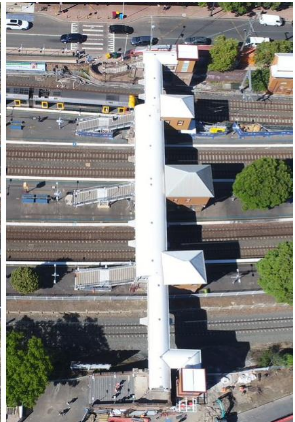
Progress photos from early 2017 to early 2018, Canopies and lifts shafts installed, civil works under construction on Loftus Crescent around street access lift shaft.