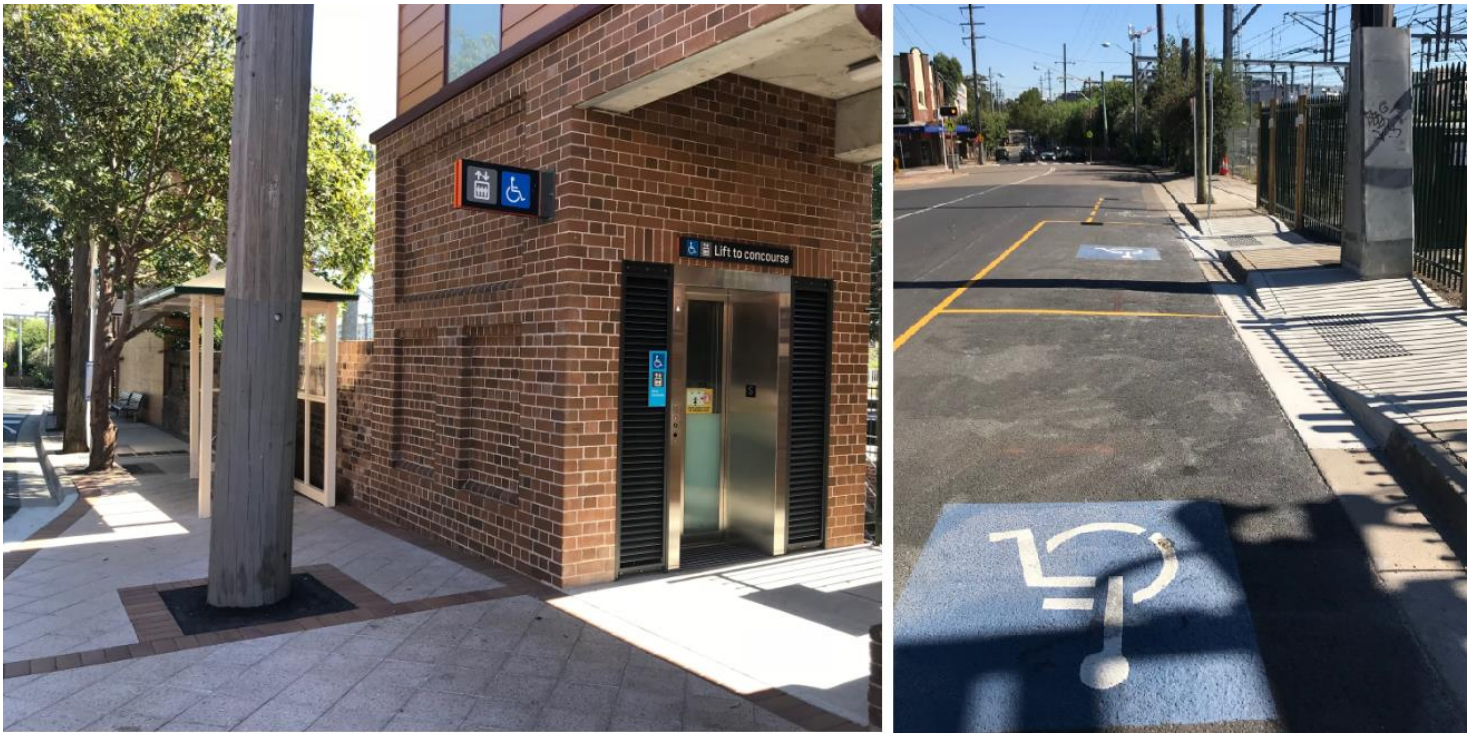
Lift access on The Crescent, upgraded bus shelter with directional tactiles and new pavers. Installation of two new disabled parking spots with ramp access on the footpath.