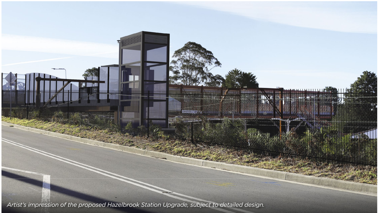
Artist's impression of the proposed Hazelbrook Station Upgrade, subject to detailed design.