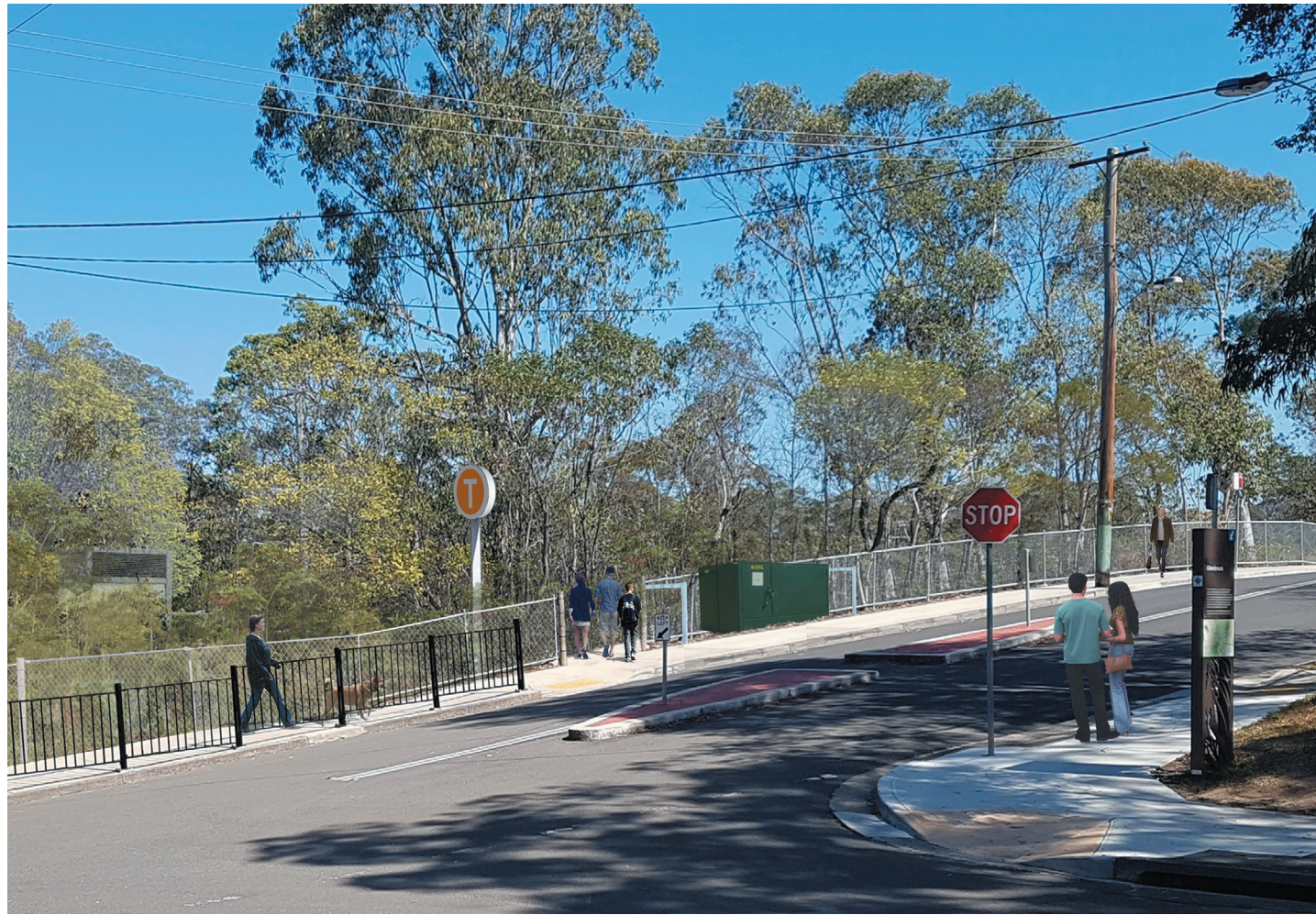
Artist's Impression of station access off Burfitt Parade