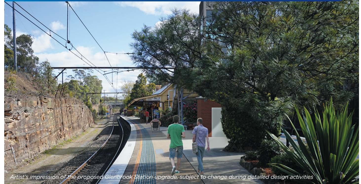
Artist's impression of the proposed Glenbrook Station upgrade, subject to change during detailed design activities