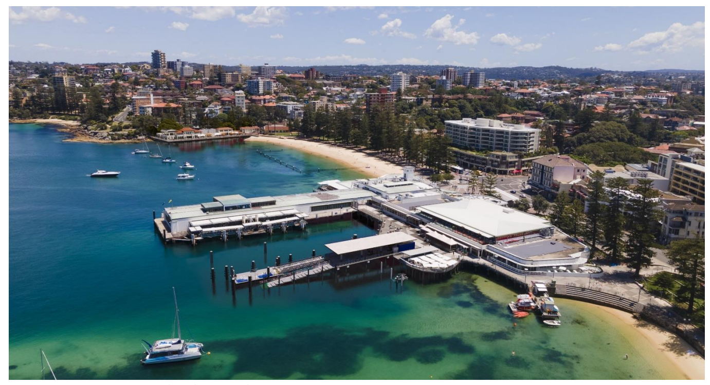
Artist impression of proposed works at Manly Cove

Following community feedback on the concept design earlier this year, we have updated the design and prepared a Review of Environmental Factors (REF). We invite the community to provide feedback on the REF by Friday 23 December 2022.