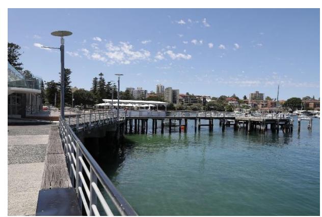
View of the existing Manly Wharf 3

The new design will provide improved customer amenities, and improved accessibility for all customers using the wharf including those with assisted and unassisted mobility needs.