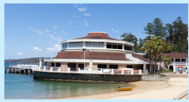
View of the former Sea Life building where signs will be installed around the ground floor

Story Walk at the former Manly Sea Life building