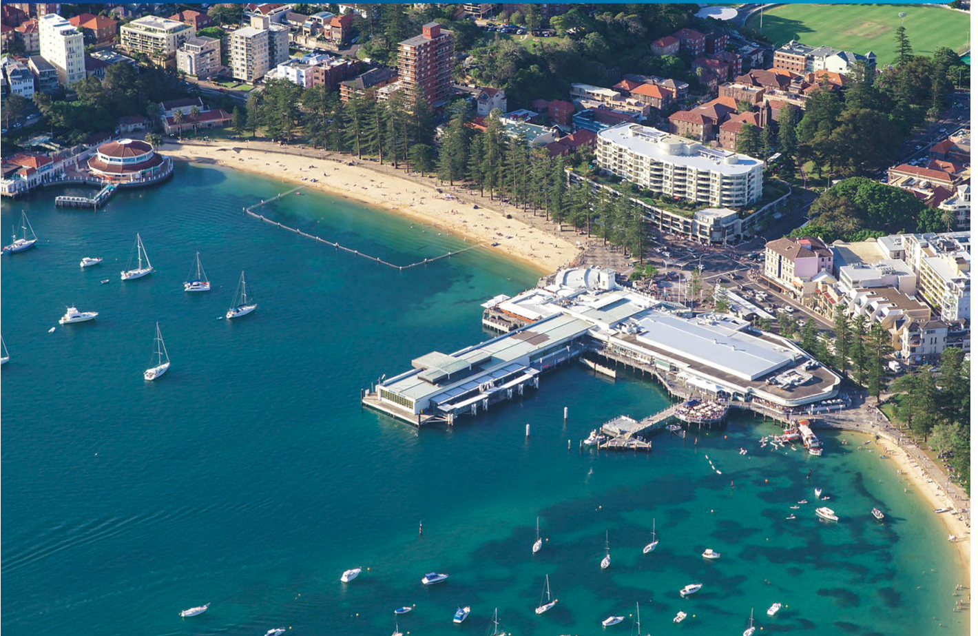
Manly Cove drone shot

Manly Cove is an iconic and locally significant place. People and vessels have been part of Manly accessing the Cove by sea for centuries and continue to do so.