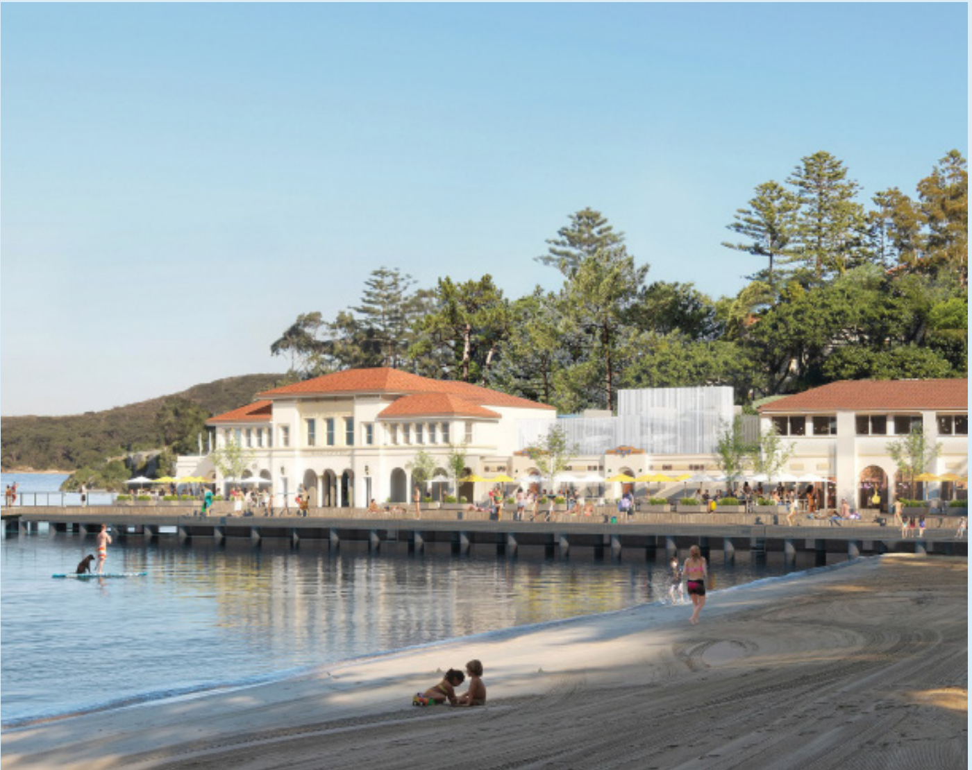
Artist's impression (indicative only – subject to design development and consultation)