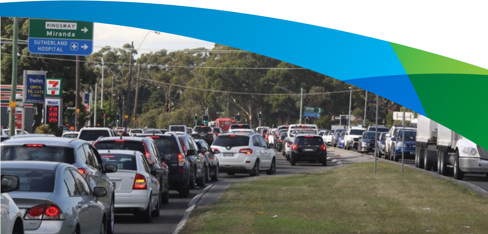
Congestion on the Princes Highway