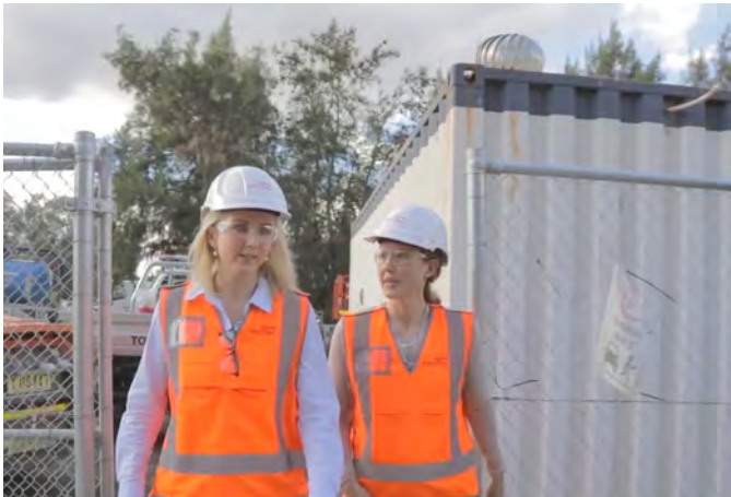
Employment targets to increase diversity in the workplace

We will provide training and on-the-job learning to prepare a new generation of workers for a future in the construction sector. We also want to increase diversity in our workforce. This means we will deliver training and opportunities to include more women, youth, Aboriginal people and Aboriginal-owned businesses in our industry. As a priority, we are focusing on using local businesses who can provide goods and services to our project.