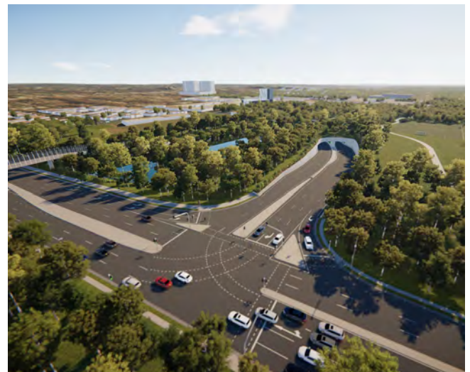
Artist impression of M6 Stage 1 President Ave tunnel entrance

The plans will describe the construction methods that will be used to minimise impacts to those who live, work and travel through the project area. You will be able to see these plans on our interactive portal once they are prepared.