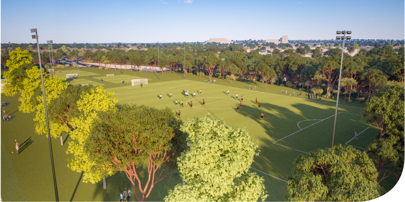
Figure 3: East Bicentennial Playing Fields proposed upgrade and facilities (artist's impression)