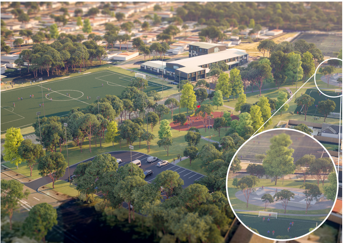
Figure 1: Ador Park/McCarthy Park Precinct proposed upgrade and facilities (artist's impression)

Insert: Proposed new skate park and 'midi' sized synthetic field (artist's impression)