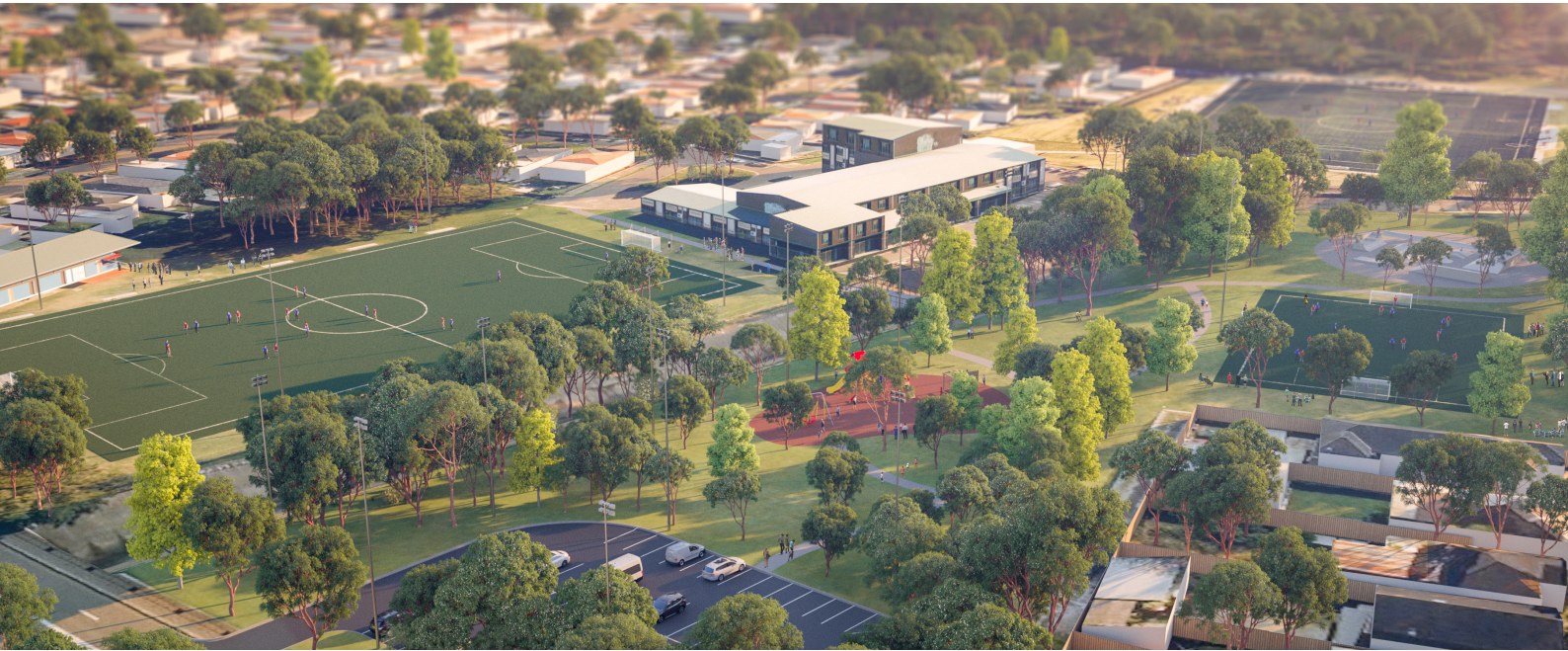
Figure 1: Ador Park/McCarthy Park Precinct proposed upgrade and facilities (artist's impression)

The F6 Extension Stage 1 will deliver connectivity from Sydney's south to the wider Sydney motorway network, making journeys easier, faster and safer. It will remove more than 2,000 trucks a day from surface roads, and help return local streets to local communities.