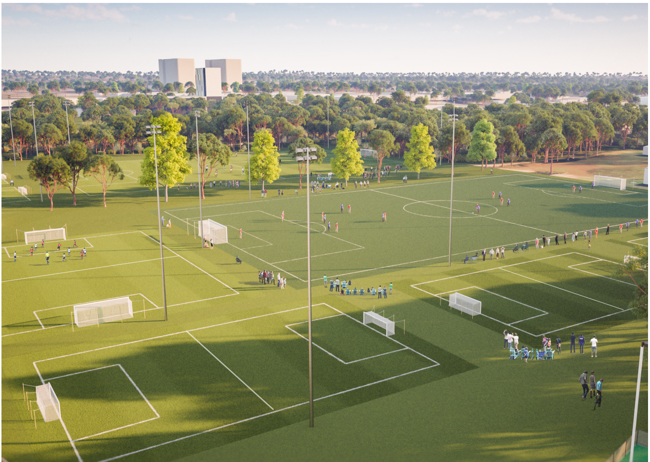
Figure 2: Brighton Memorial Playing Fields proposed upgrade and facilities (artist's impression)

The proposal to upgrade Ador Park/McCarthy Park and Brighton Memorial Playing Fields are not detailed in the Environmental Impact Statement and will require additional environmental investigation. We will continue to engage with Bayside Council, the SLG and local community to refine this proposal.