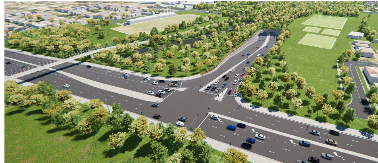
Above: F6 Extension Stage 1 (artist's impression)

The F6 Extension Stage 1 will deliver the missing link from Sydney's south to the wider Sydney motorway network, making journeys easier, faster and safer. It will remove more than 2,000 trucks a day from surface roads, and help return local streets to local communities.