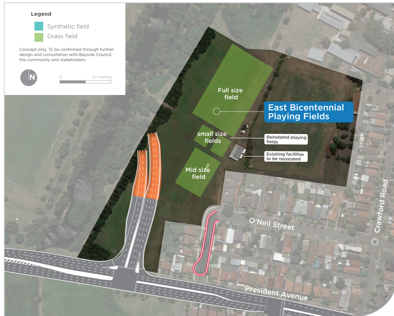
Figure 3: Proposed design for East Bicentennial Playing Fields following construction