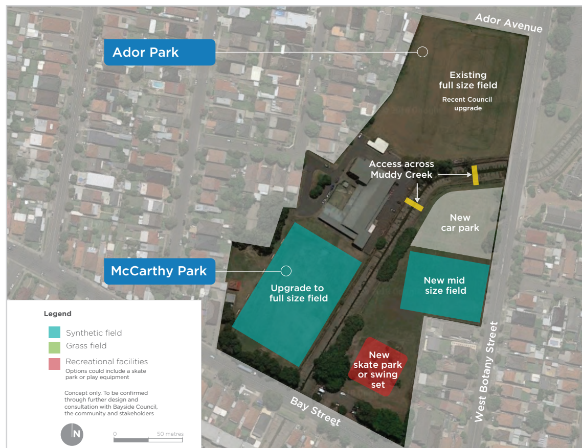
Figure 1: Ador Park/McCarthy Park Precinct proposed upgrade and facilities