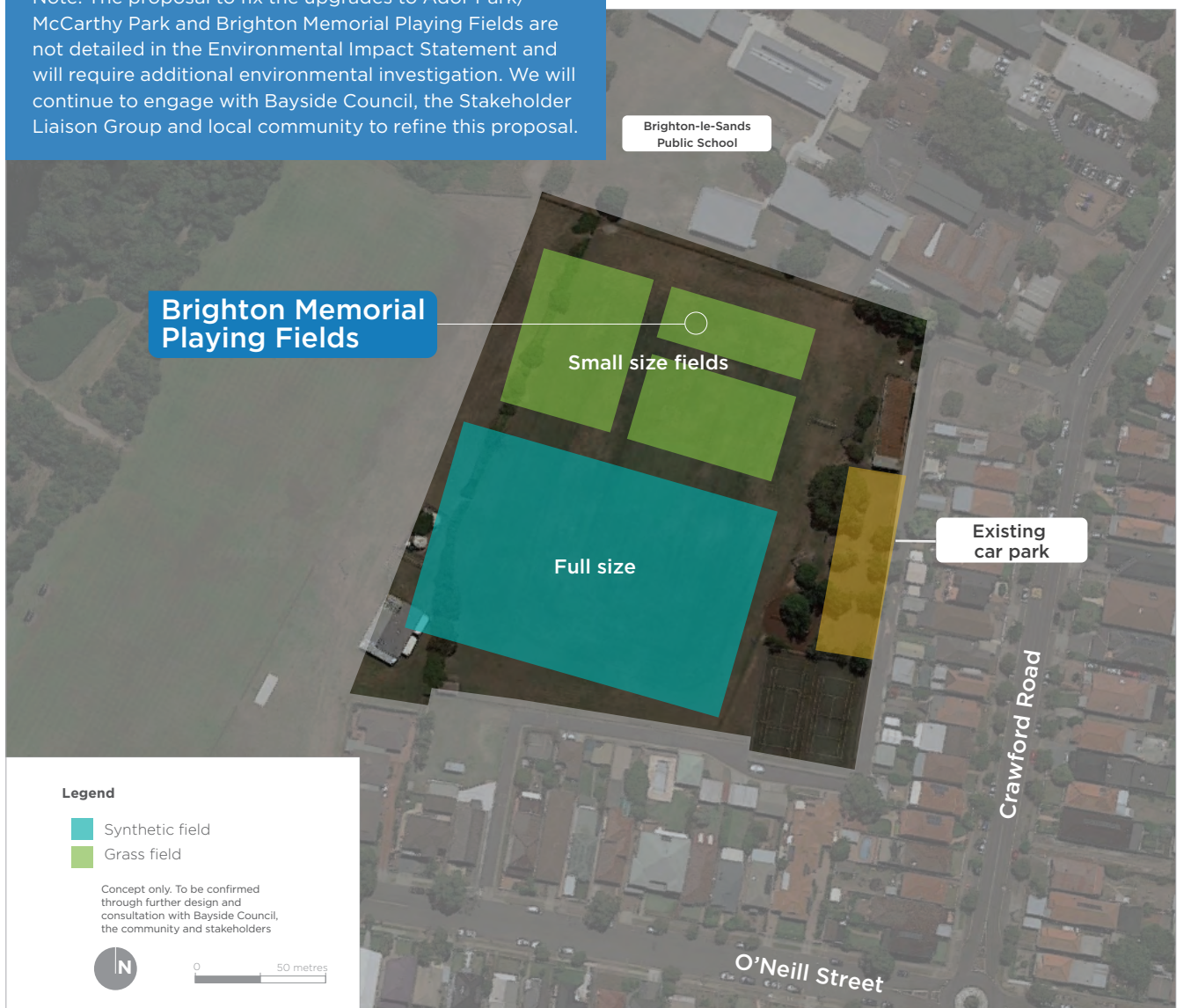
Figure 2: Brighton Memorial Playing Fields proposed upgrade and facilities

Note: The proposal to fix the upgrades to Ador Park/McCarthy Park and Brighton Memorial Playing Fields are not detailed in the Environmental Impact Statement and will require additional environmental investigation. We will continue to engage with Bayside Council, the Stakeholder Liaison Group and local community to refine this proposal.