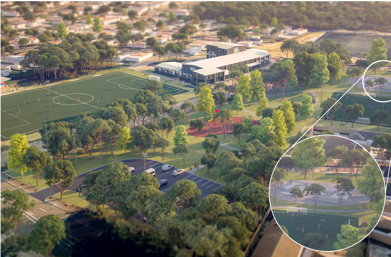
Figure 2: Ador Park/McCarthy Park Precinct proposed upgrade and facilities (artist's impression)

Insert: Proposed new skate park and 'midi' sized synthetic field (artist's impression)