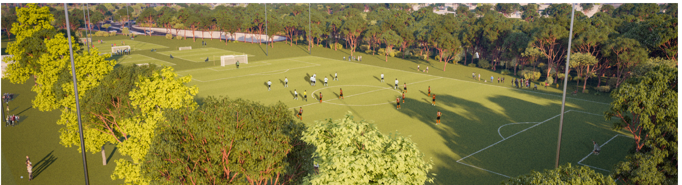
Figure 4: East Bicentennial Playing Fields proposed upgrade and facilities