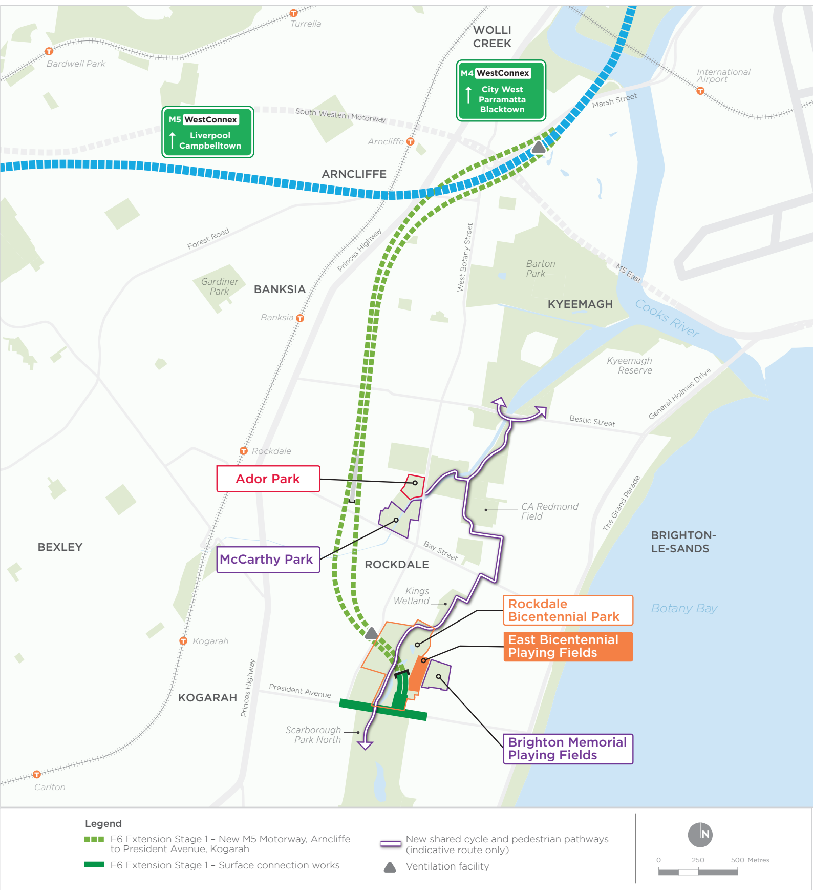
Figure 5: Key features of the F6 Extension Stage 1