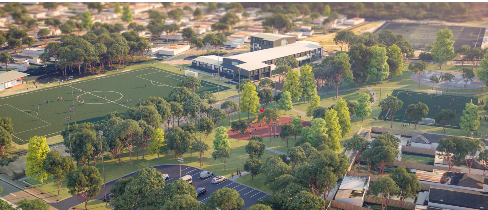
Figure 1: Ador Park/McCarthy Park Precinct proposed upgrade and facilities (artist's impression)

The F6 Extension Stage 1 will deliver the missing link from Sydney's south to the wider Sydney motorway network, making journeys easier, faster and safer. It will remove more than 2,000 trucks a day from surface roads, and help return local streets to local communities.