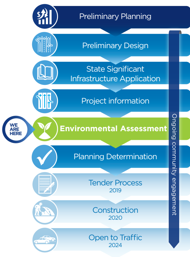
Figure 6: F6 Extension Stage 1 project timeline