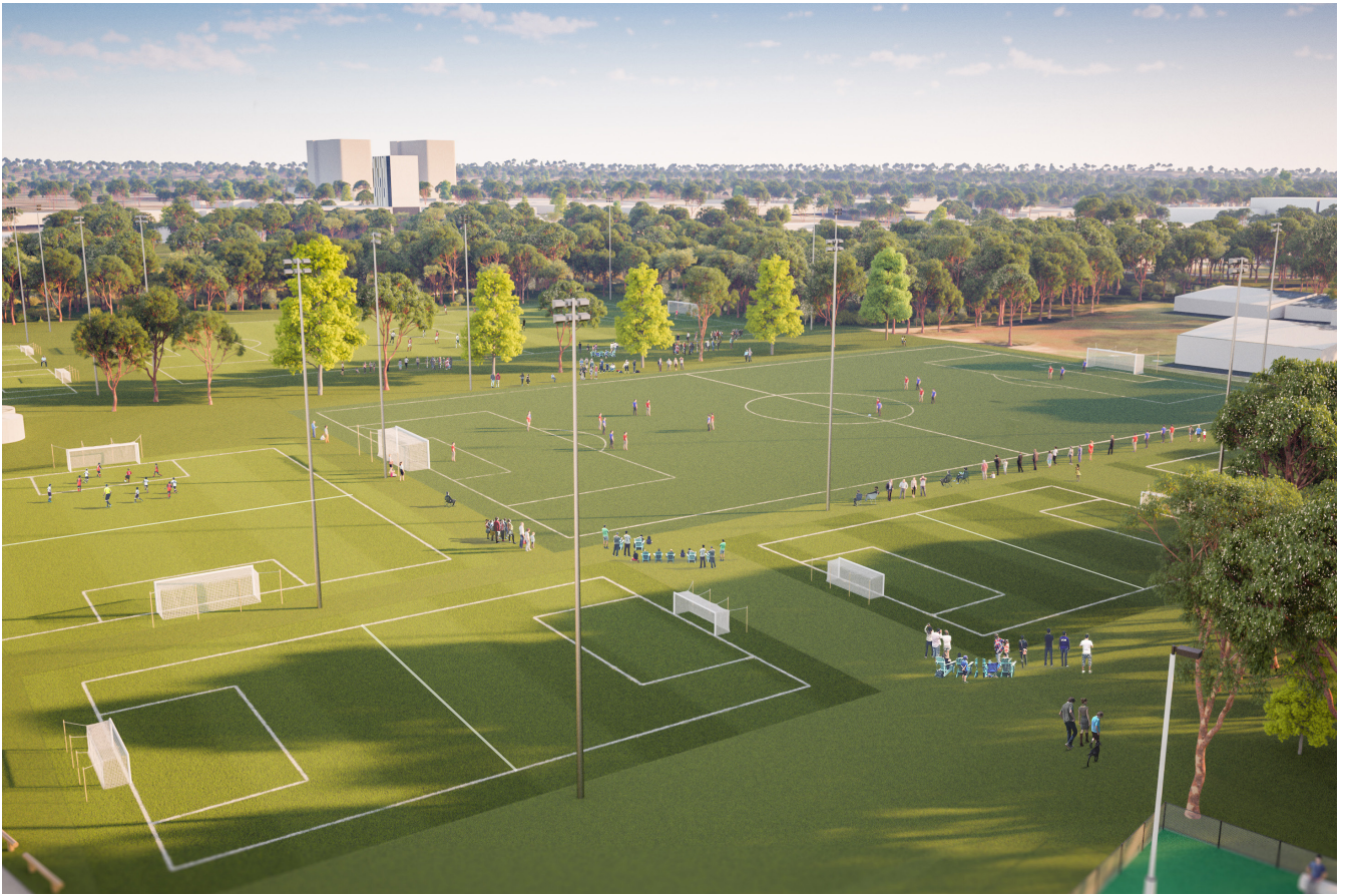
Figure 3: Brighton Memorial Playing Fields proposed upgrade and facilities (artist's impression)

Brighton Memorial Playing Fields are used by local football clubs and Brighton-Le-Sands Public School as an extension of the outdoor playing area for the students. We are proposing to re-configure the playing fields into a mix of grass and synthetic fields. This design will be developed in consultation with all stakeholders including the school, as we understand it is important to maintain the schools current use of this recreation space.