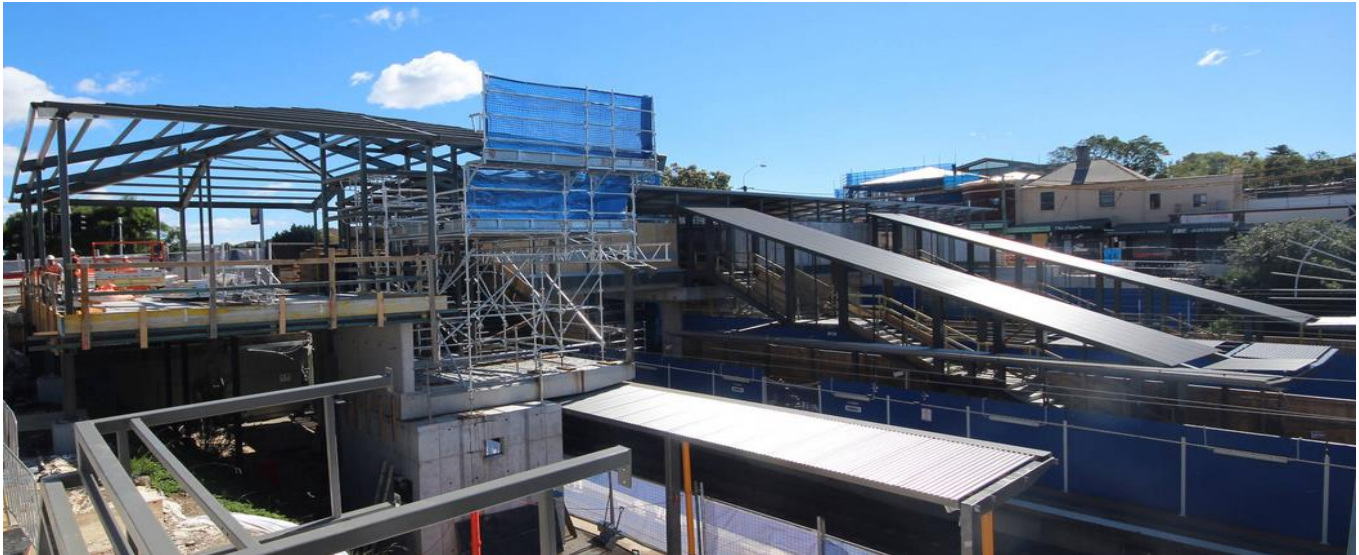
New station concourse under construction – April 2017

The Croydon Station Upgrade includes new lifts, a new pedestrian footbridge, improved shelter, new bicycle racks and upgrades to lighting and CCTV surveillance.