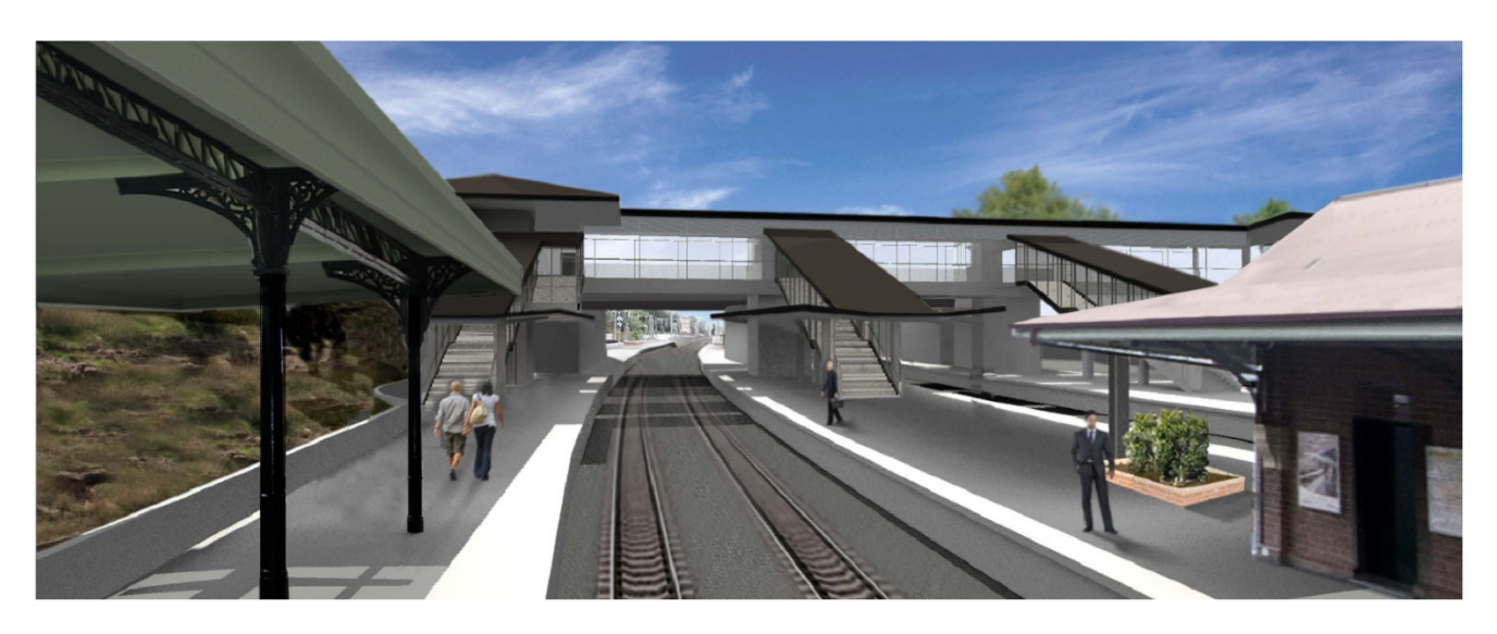
Figure 2 8: Architect's visualisation of likely view from station platforms (by CCG)

Positive changes to views from the platforms, resulting from the revised Project, include: