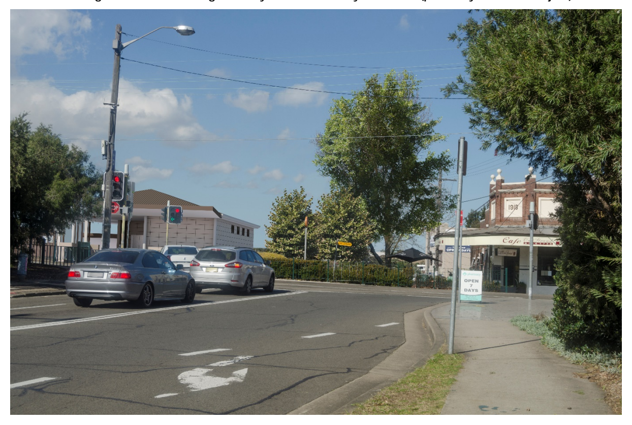
Figure 2-5: Photomontage of likely view from Paisley Road west (revised Project)