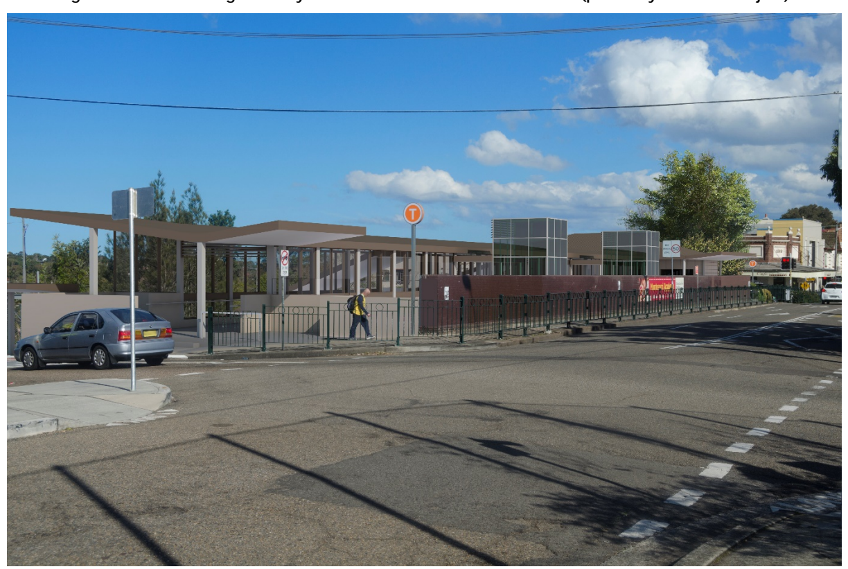
Figure 2-3: Photomontage of likely view from corner of Meta Street & PLC (revised Project)