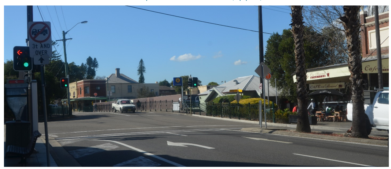
Figure 2-6: Viewpoint C - existing view

Figure 2-6 illustrates the existing view from this viewpoint located within the main shopping area.