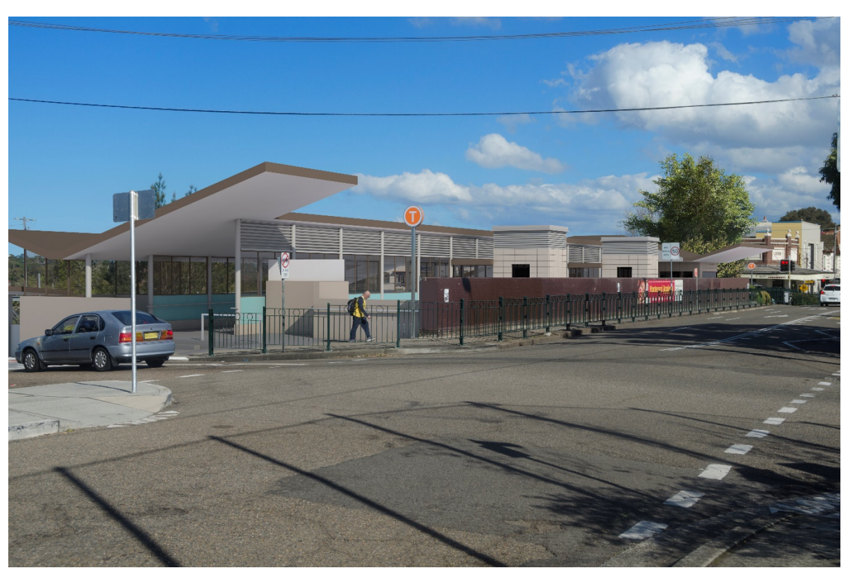
Figure 2-2: Photomontage of likely view from corner of Meta Street & PLC (publically-exhibited Project)