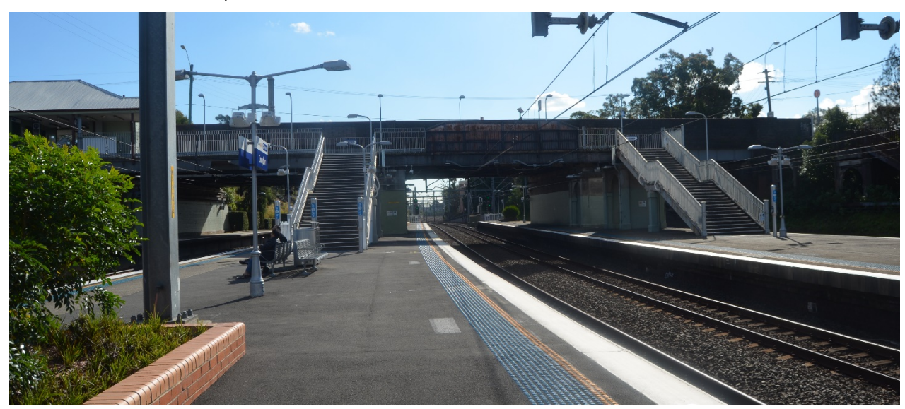
Figure 2-7: Viewpoint G - existing view from Platform 3 towards footbridge and booking office

Figure 2-7 illustrates the existing view of the upper station from the platforms, and Figure 2-8 is an architectural visualisation of the likely view from the station platforms.