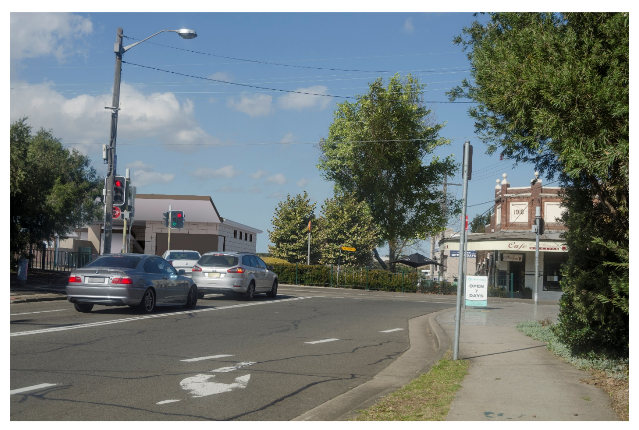
Figure 2-4: Photomontage of likely view from Paisley Road west (publically-exhibited Project)